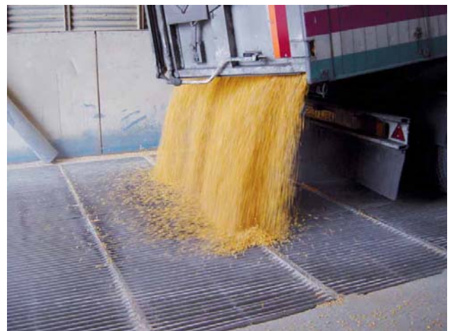
At field level, additional costs are mainly associated with equipment cleaning time between GM and non-GM fields.