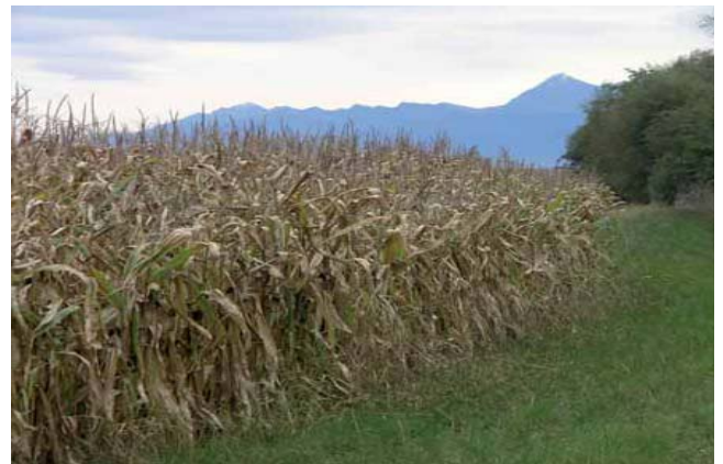
Additional costs associated with the coexistence of the GM and non-GM sectors, are incurred by separation and monitoring operations.

The relative importance of each of those sources depends on the crop and the way the sector is organised. The volunteer growth for instance, which creates major problems in oilseed rape crop management, does not occur in French maize. The case of Spain, where Bt maize has been grown since 1998, shows that coexistence between GM, non-GM and organic crops is not linked to any major economic or commercial problems. With a ceiling of 15,000 ha until 2002, the development of GM maize crops in Spain only really took off in 2003 with 32,000 ha of Bt Maize, which represented 7% of the