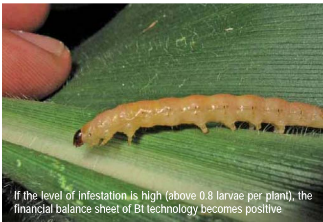
If the level of infestation is high (above 0.8 larvae per plant), the financial balance sheet of Bt technology becomes positive

The additional cost incurred for the control of a non-GM field because of the presence of GM maize nearby is 13€/ha.